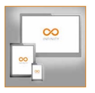
Insertion of screens