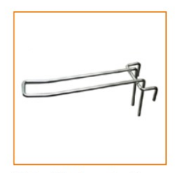
Grid wall hooks and various accessories