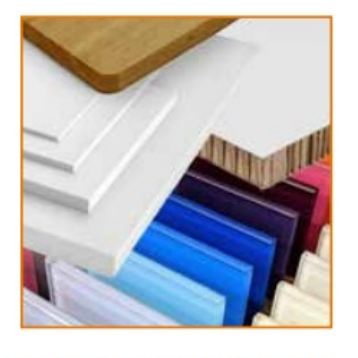
Many possible materials for the shelf arrangement and the accessories