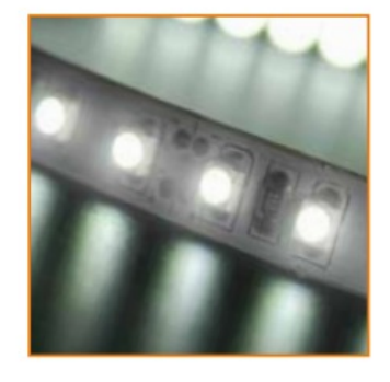
Insertion of LED lighting