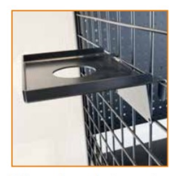
Tailor-made product support