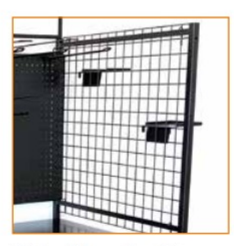
Grid wall for various fixings