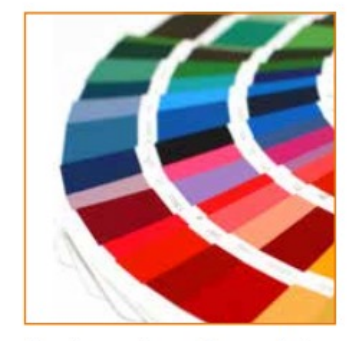
Structure colour of your choice