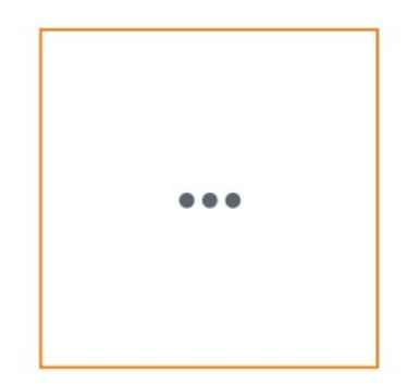
AN INFINITY OF OPTIONS TO DEVELOP